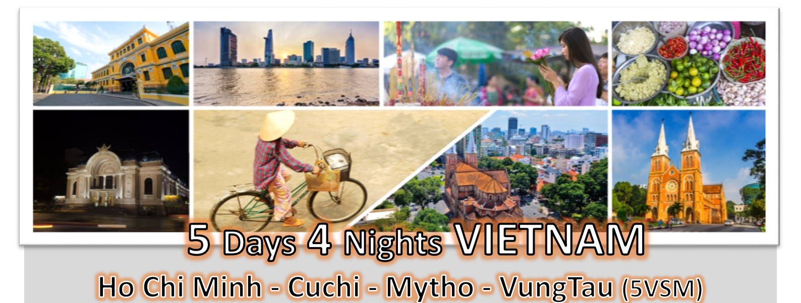
Day 1~ KK - Transit City - Ho Chih Min (Dinner)