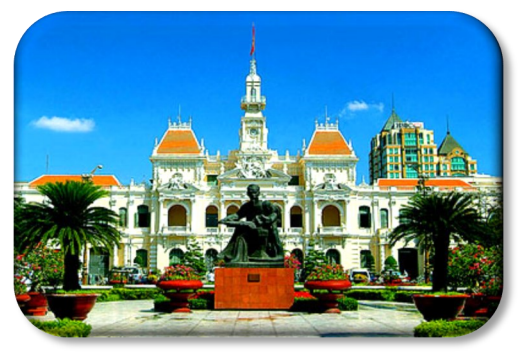
Day 2~ HO CHI MINH - CU CHI - VUNG TAU (Breakfast/Lunch/Dinner) HOTEL: Muong Thanh Or Similar

Upon arrival at Tan Son Nhat airport, meet by our representative and transfer to hotel for check-in . A Short sightseeing tour of Ho Chi Minh City (formerly Saigon): Visit Notre Dame Cathedral, The Old Post Office and The People's Committee Hall. Dinner and overnight in SaiGon.